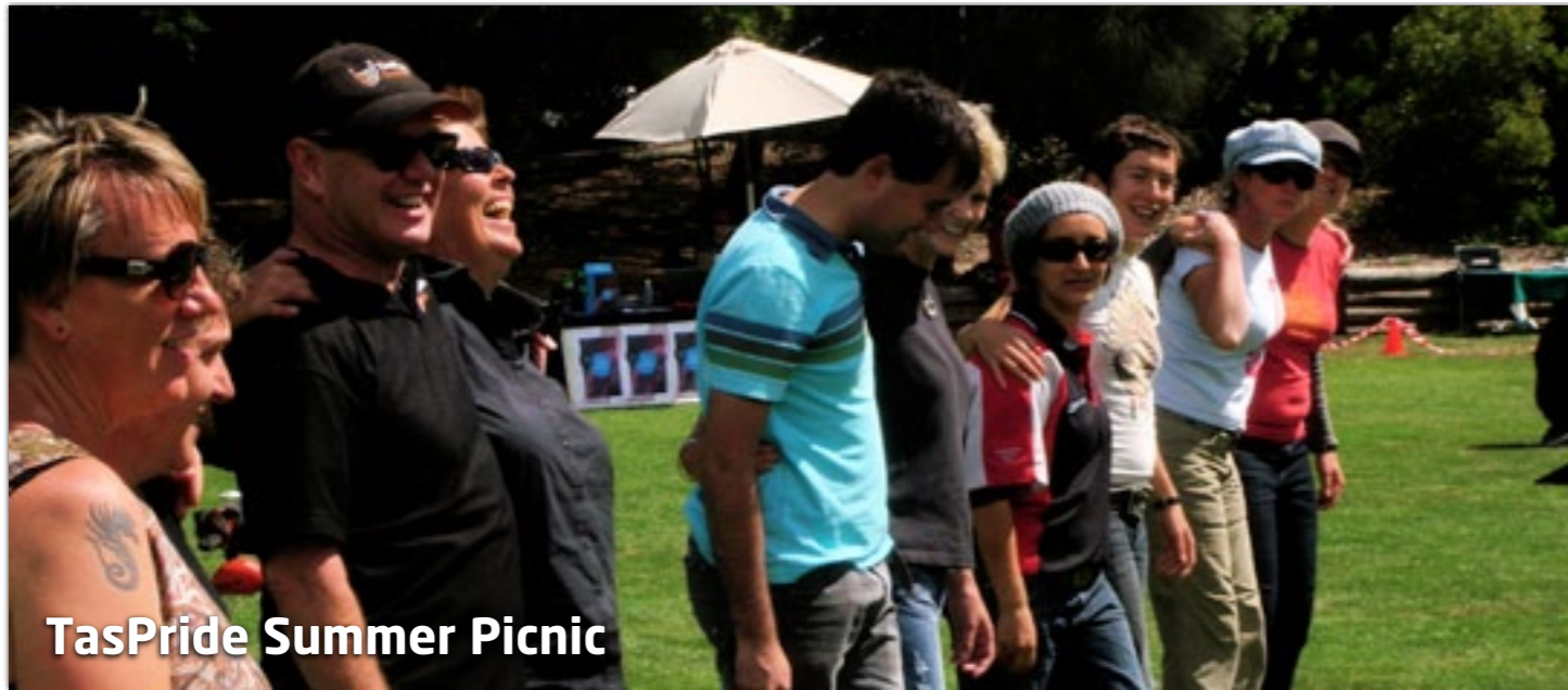
TasPride Summer Picnic